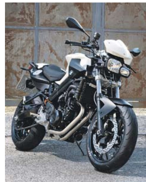
BMW F 800 R naked street bike.