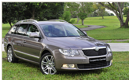
Turning in a sterling road show, the Skoda Superb Combi is the wagon for the non-brand conscious.

Fuel consumption: 7.3 litres/100km (city-highway)